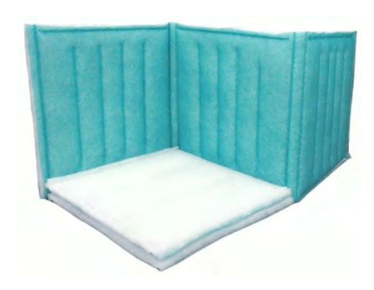
Poly Shield G8 Panels & Links

Depth-Loading Advantage Priced Like A Pleat